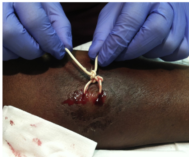
Figure 2. Loop drain technique.